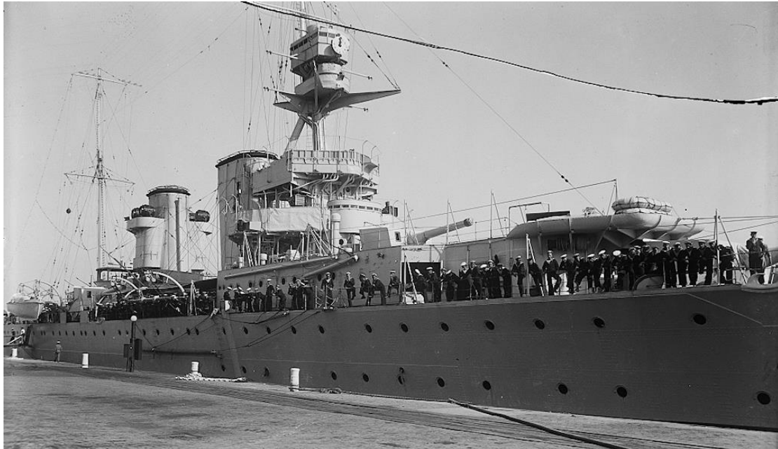
HMS RALEIGH at Washington navy Yard.