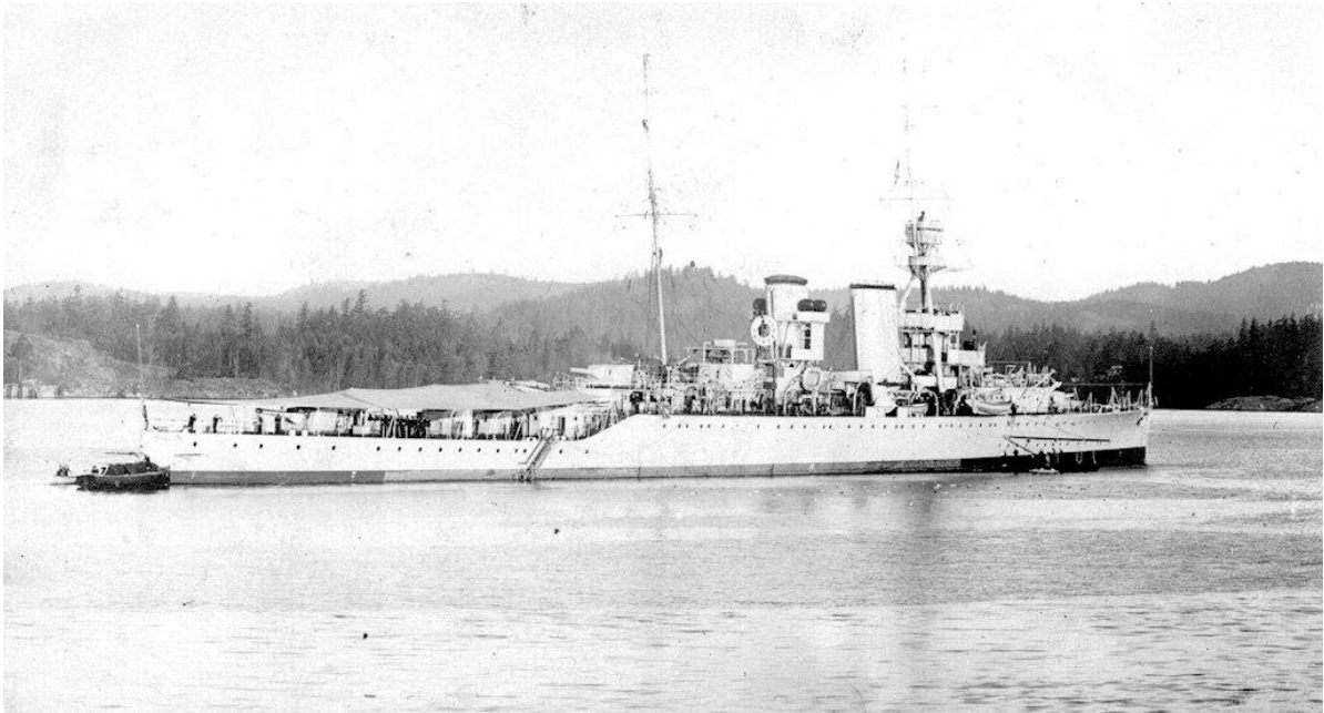
HMS RALEIGH in Canadian waters