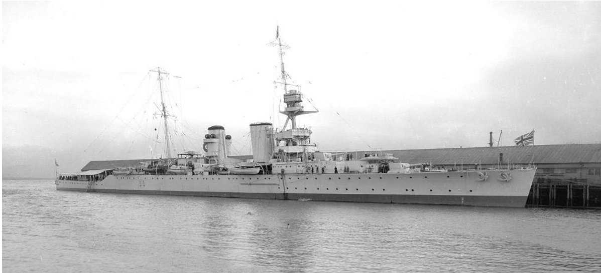
HMS RALEIGH at Pier D, Vancouver.

(Transcription of the hand-written original)