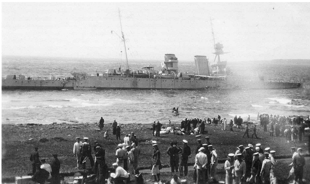
HMS RALEIGH wrecked at Point Amour, Fortreau Bay, Labrador, Canada, with surviving crew ashore

Thurs Aug 10th. Beautiful march over the rocks to Forteau carrying about a ton of gear. Billeted now in a fisherman's cottage & waiting for ship to take us home. Said ship expected on Sunday So as I'm like the barber's cat, "off" & finished with the Raleigh apparently this log ends. The first I've ever kept and it will be the last.