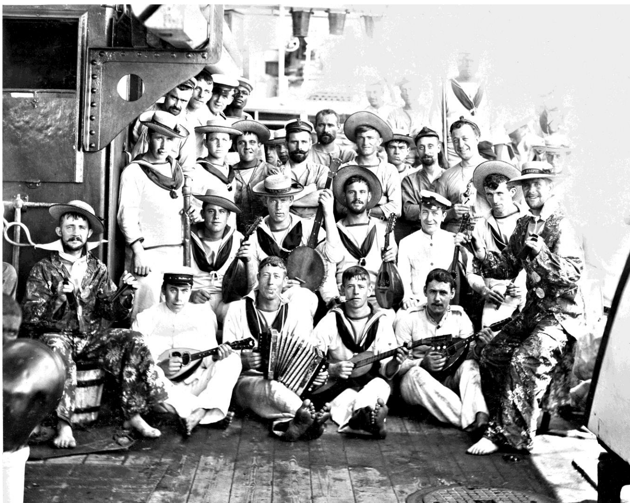
Concert party – an example of how the crew would put on their own entertainments, complete with musicians and entertainers with fancy costumes.. Note these men are barefoot. Some of the Lascar crewmen can be seen in the rear; all of these ships on the East Indies station Lascar seamen in thiret ship's coompany. [this picture is taken on READBREAST's siter ship MAGPIE]