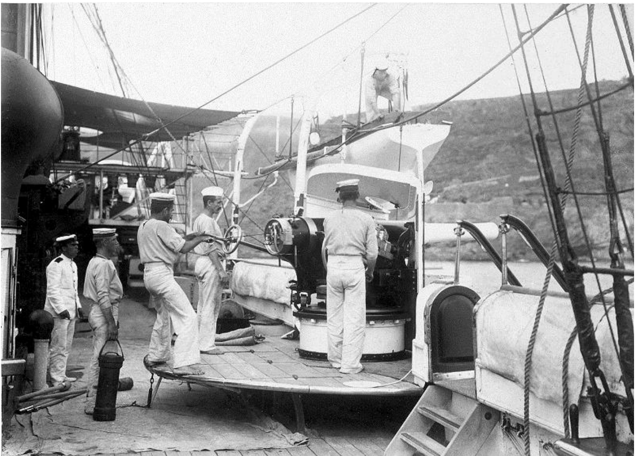
The starboard midships BL 4" 25 pdr gun about to fire. The gunner is about to pull the lanyard that will fire the gun. Note the gun crew on the platform are all barefoot. The ships entry port is immediately aft of the turret with its handrails in place [this picture is taken on READBREAST's siter ship MAGPIE]

General evolution at 4.30 a.m. Cut bower anchor. Bahreïn returned at 5 p.m. No news except of about 500 Turkish troops having landed at Al Khatif.