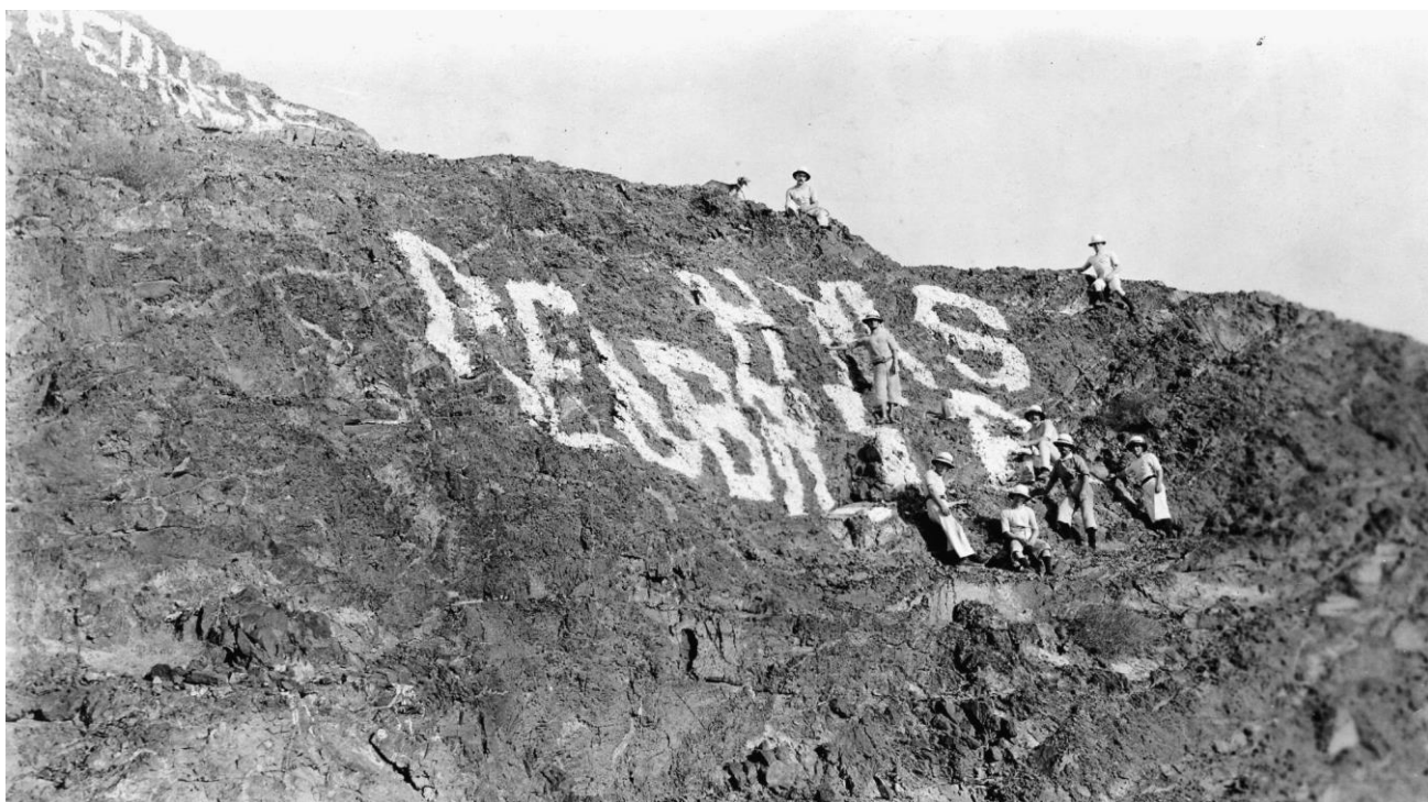
It was the custom for RN ships serving in the Gulf to paint the vessel's name on the rocks at Muscat. In the photograph the sailors from HMS Redbreast are caught in the act of leaving their mark for prosperity by painting the ship's name on the rocks. Date unknown.

Arrived at Muscat and anchored at 7.30 a.m. Distance shown by log 899 knots. H.M.S. PROSERPINE at anchor. PROSERPINE left at 7 p.m. for Bombay to pay off. (Position of Muscat 23°37 N. Longt 58°35 E)