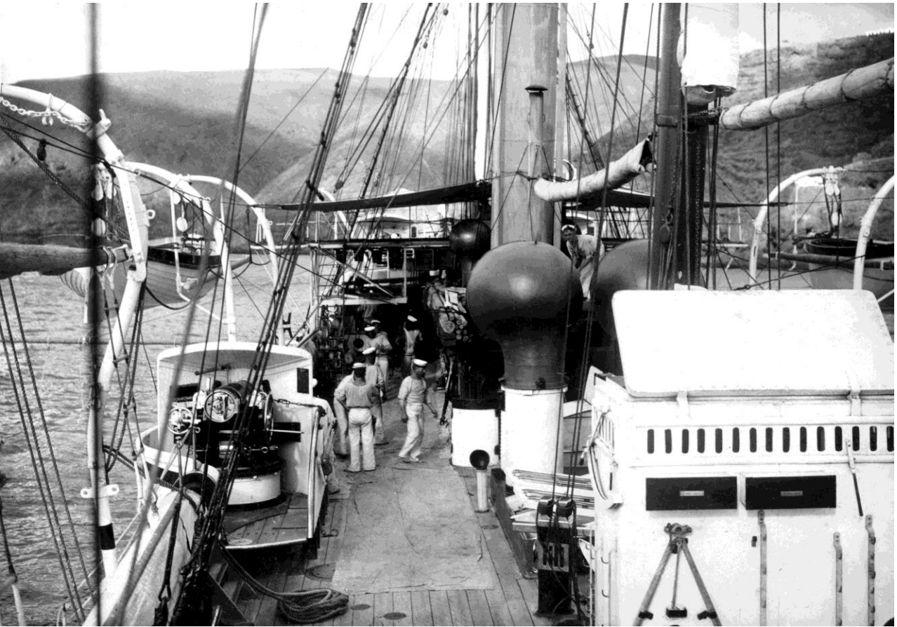
Main armament securing from action sttons – the Port midships BL 4" is secured and, the barrel facing ft. The Port side entry port is visible British and Lascar seamen are going about their suties. [this picture is taken on READBREAST's siter ship MAGPIE]

Anchored off Kishm in 7½ fms about ½ m off town. Sent ashore for fresh provisions. Evolution forenoon, clear for action, & away all boats' crews. Came on to blow hard from SW at 2 p.m., being the Suhali. Got under way at 4.45 p.m., but experienced heavy weather out to sea, so anchored under the lee of Sarak Id at 6.20 p.m.