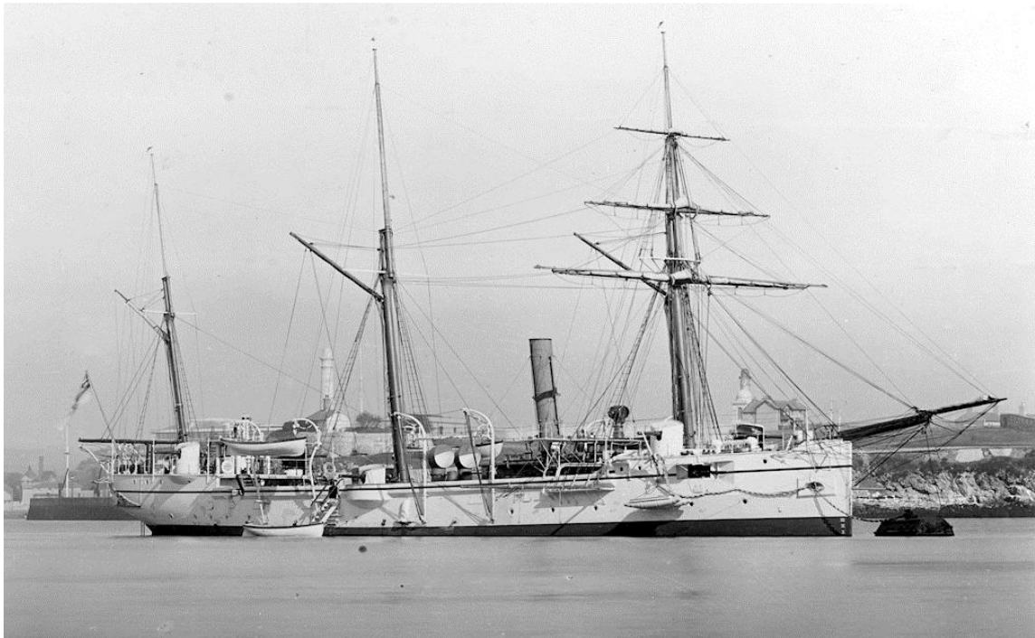
Redbreast Class screw Gunboat.